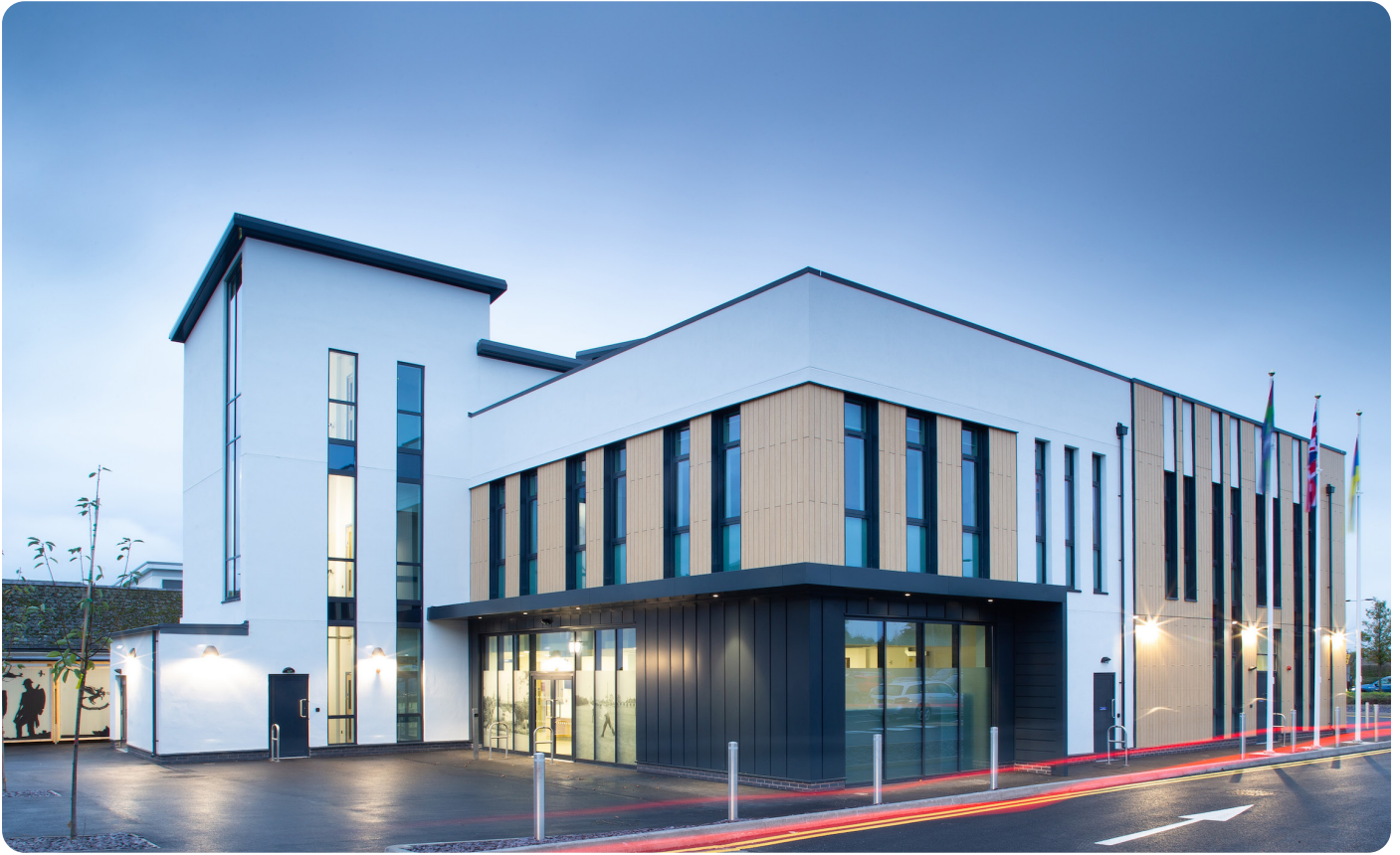
Headley Court Veterans Centre, Oswestry